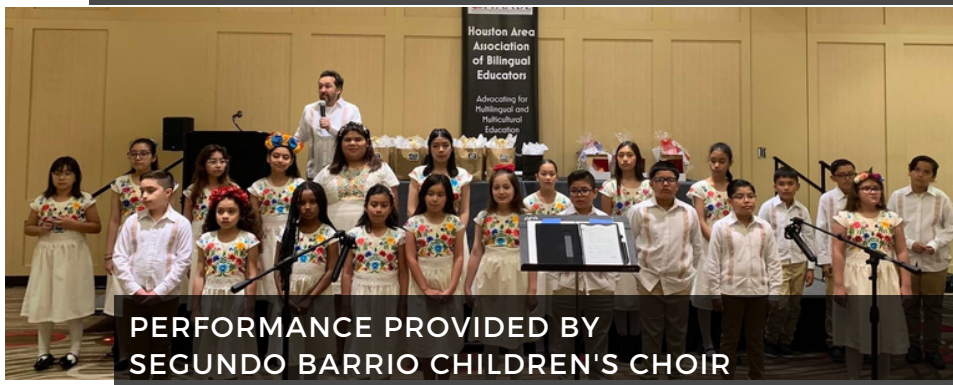
PERFORMANCE PROVIDED BY SEGUNDO BARRIO CHILDREN'S CHOIR