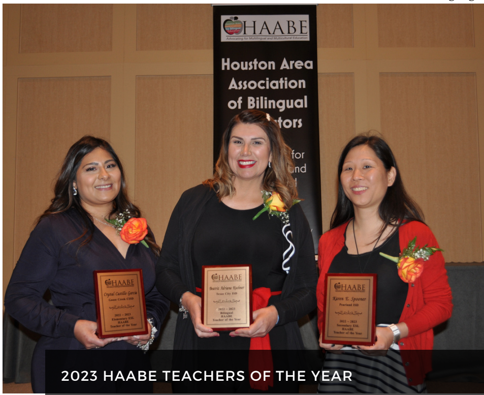
2023 HAABE TEACHERS OF THE YEAR

HAABE celebrated teachers and students alike at its 41st Annual HAABE Banquet on April 29th. Campus and District Teachers of the Year were honored for their excellence in teaching Emergent Bilingual students in bilingual, dual language, and ESL classrooms. These teachers represented nine school districts in the Houston Area. Of these teachers, three were selected as the HAABE Teachers of the Year. The HAABE Elementary Bilingual Teacher of the Year and the HAABE Secondary ESL Teacher of the Year will go on to represent the organization at the Texas Association of Bilingual Education (TABE) competition. Additionally, HAABE awarded scholarships to five deserving Houston Area students. In attendance were representatives from the Region IV ESC, TABE, and Latinos for Education. To view more highlights of the banquet, go to this link .