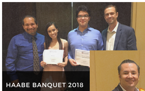
HAABE BANQUET 2018