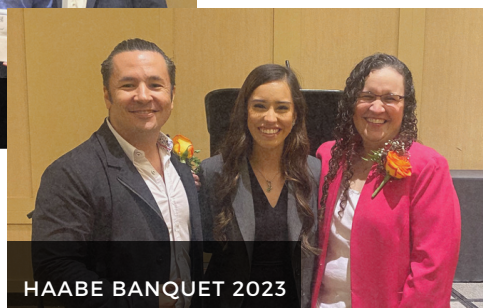
HAABE BANQUET 2023